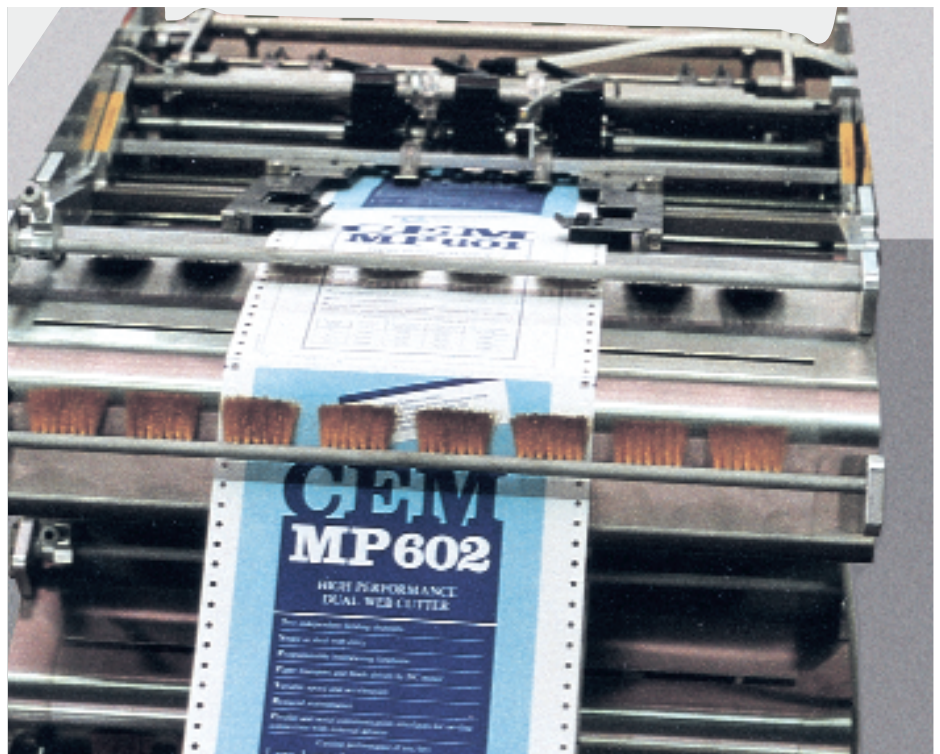
Detail of entry cutter with dual independent transports