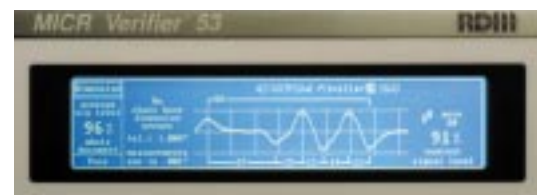
Checks for dimension errors

Other screens include: main menu, spacing errors, bar chart, extraneous ink characters, field analysis and actual signal level.