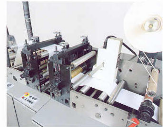
DIE CUTTING UNIT